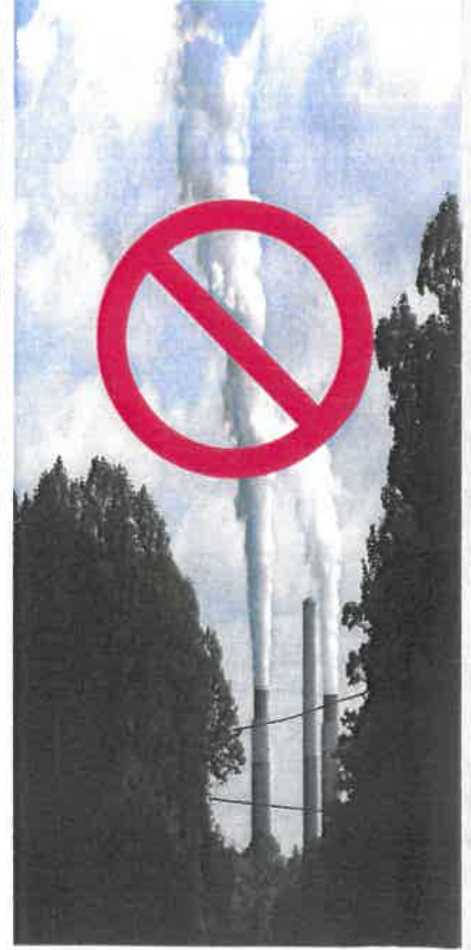
Climate Change Is Real! Pictured above are solar panels installed on the rooftop of BCC's office. On the right is one of Duke Energy's coal fired electric plants in nearby Stokes County, spewing more toxic gases. To save our planet, we must do more now!